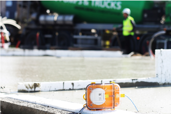
Maturix Sensors are reusable, which makes for low-cost usage.