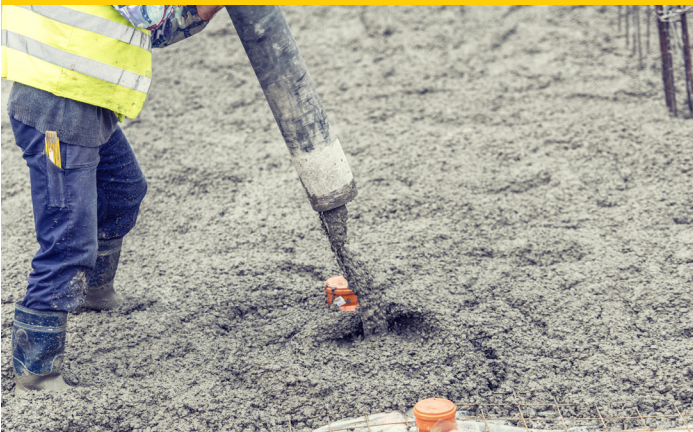
Pour the concrete, and initiate monitoring from anywhere.