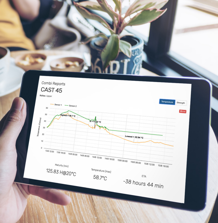
Maturix™ Smart Concrete® Sensors wirelessly transmit real-time data on temperature and strength development to your device.