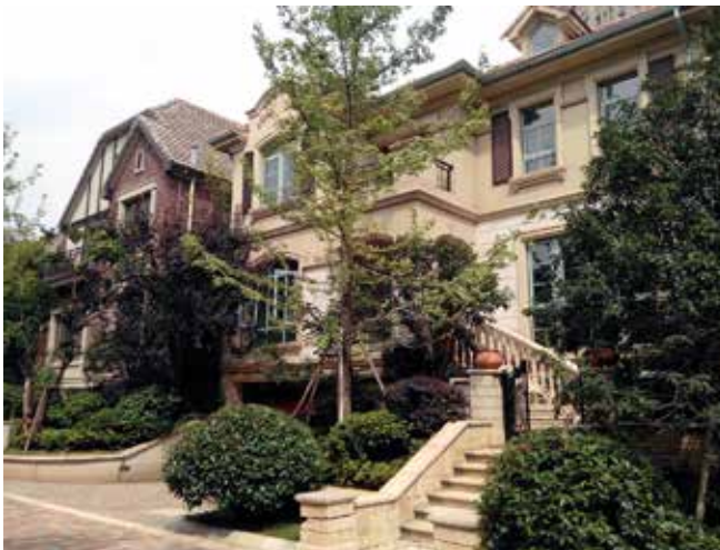
American Dream Development, Changsha, China