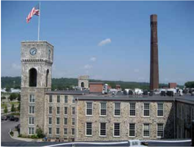
Royal Mills Riverpoint Apartments, West Warwick, Rhode Island, USA