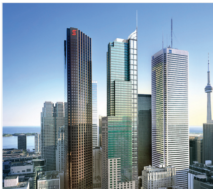
The completed Trump Tower in the heart of downtown Toronto.