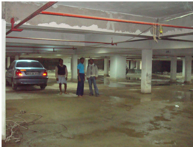
Five hp2 pumps working continuously

removing the PCC layer and waterproofing the concrete. The coves along the columns were treated with Krystol Baricote and the entire floor was treated with Krystol T1 at 0.8 kg/m 2 then a second coat with Krystol T2 at 0.8kg/m 2 . After treating the entire basement, all the active sources were treated with the Krystol Crack Repair system.