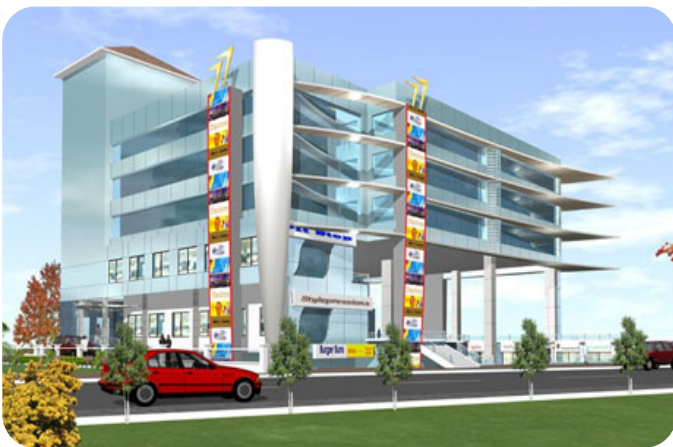
Artist rendering of completed commercial building

The main cause was active leakage sources in the ramp areas and even some areas on the floor level. The developer had provided drains for the main area of leakage and was pumping out water every 15 minutes. The floor area also had active sources under the PCC cover. All the walls were covered with thick plaster. If the water was not pumped out, it would accumulate up to 1.5ft on the basement floor within 45 minutes.