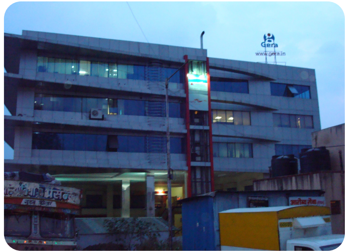
Gera 77 building