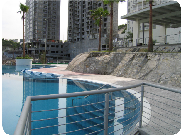
Almost 2,500 kilograms of KIM was used to waterproof this pool.

Almost 2,500 kilograms (5,500 pounds) of Krystol Internal Membrane were used to waterproof the pool – keeping the water safely and securely in the pool for all residents to enjoy.