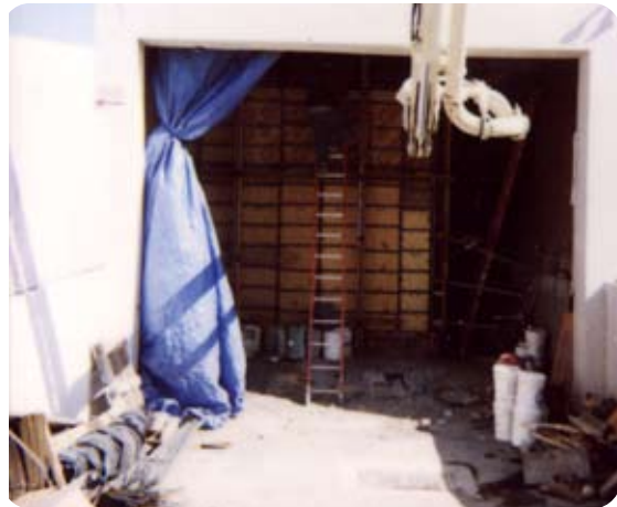
Difficult pumping requirements for the indoor structure