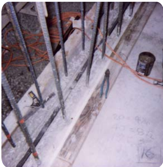
Below grade view of Toronto International Airport