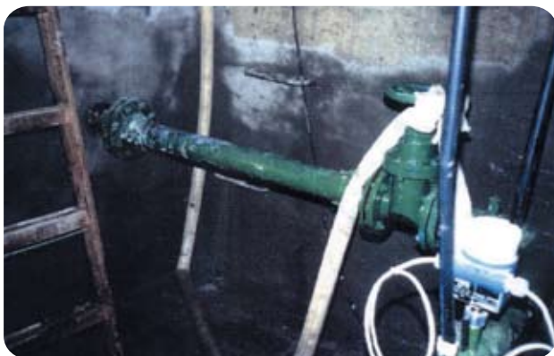
Old concrete dried up after years of water saturation.