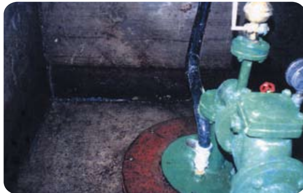
Krystol™ repair method stops leaks.