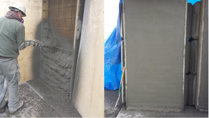
Fig. 1: Vertical test panel shoot