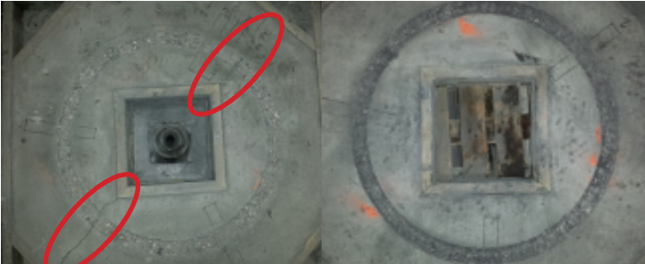
Fig. 3: Horizontal shotcrete test panels after abrasion test (control - left. Hard Cem - right.) Control cracks highlighted in red. No Hard-Cem cracks developed during the test.