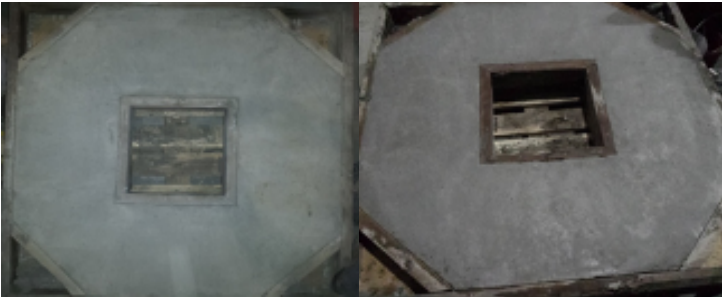
Fig. 2: Horizontal shotcrete test panels before abrasion test (control - left. Hard Cem - right.)