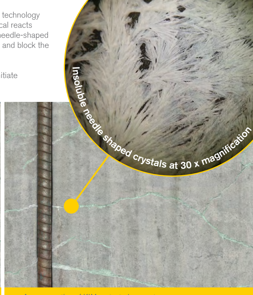
A cross section of KIM protected concrete