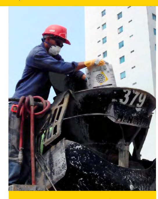
KIM is added to the concrete before placement