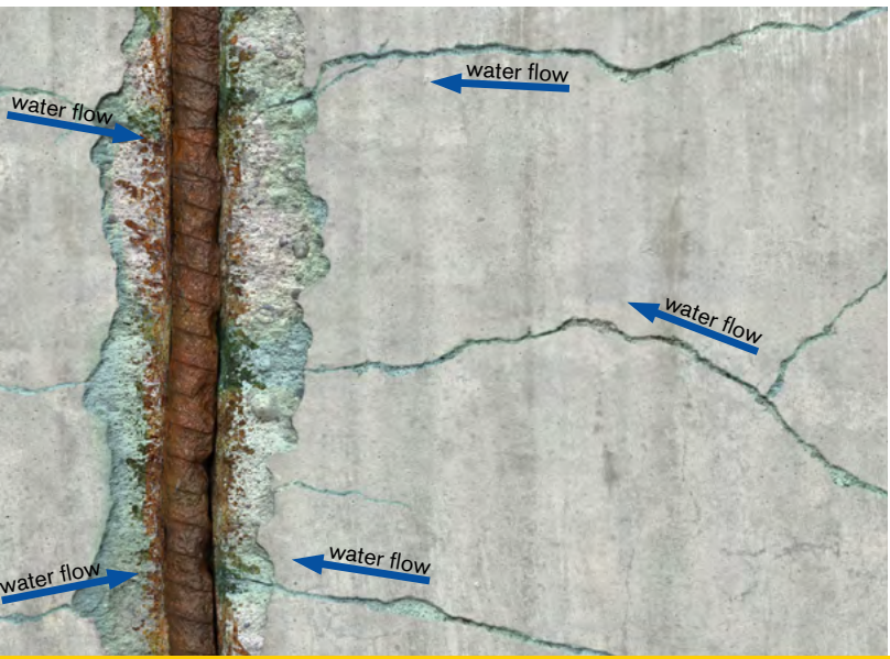
A cross section of unprotected concrete

Any moisture introduced over the lifespan of the concrete will initiate crystallization, ensuring permanent waterproofing protection.