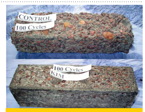
Control concrete vs KIM treated concrete after 100 cycles of freezing and thawing.

Reduced 70% Reduced 25% Reduced 33% Reduced 86% Improved 11% Improved 7% Reduced 17%