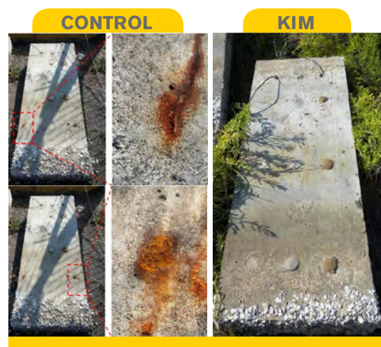
After 10 years marine exposure; Control concrete / KIM treated concrete.