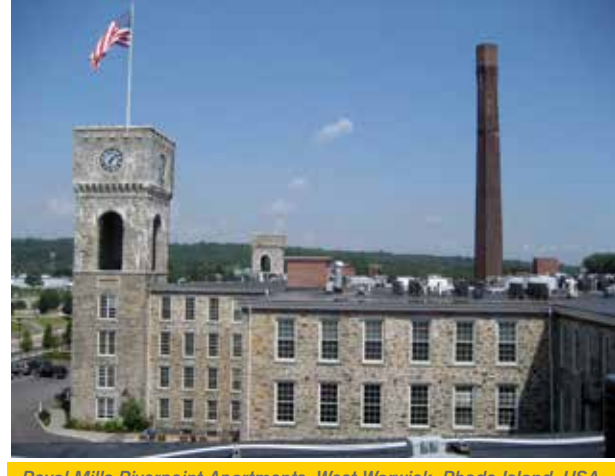
Royal Mills Riverpoint Apartments, West Warwick, Rhode Island, USA