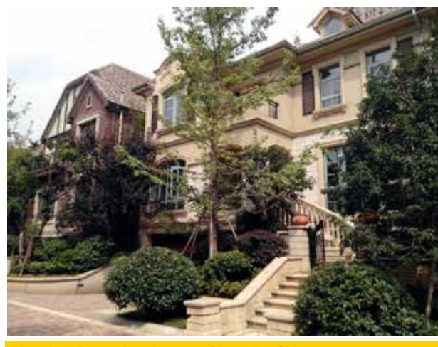
American Dream Development, Changsha, China