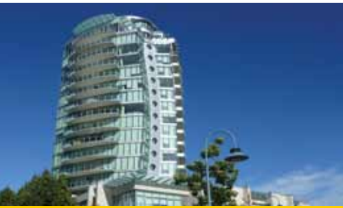
The Erickson Underground Parking Vancouver, B.C., Canada

The Erickson is a luxury, 20-story concrete and steel-trussed building with glass on all sides and an undulating shape that rises from the edge of False Creek in downtown Vancouver, surrounded by water on three sides.