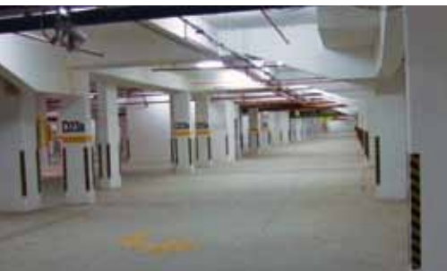
KK Times Square Underground Parking Kota Kinabalu, Malaysia