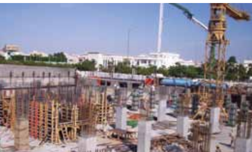
Al Mashfa Private Hospital Underground Parking, Jeddah, Saudi Arabia

The Krystol Waterproofing System eliminated any need for exterior waterproof membranes, saved time and labour costs, and ensured a guaranteed leak-free building that can proudly bear the Arthur Erickson name.