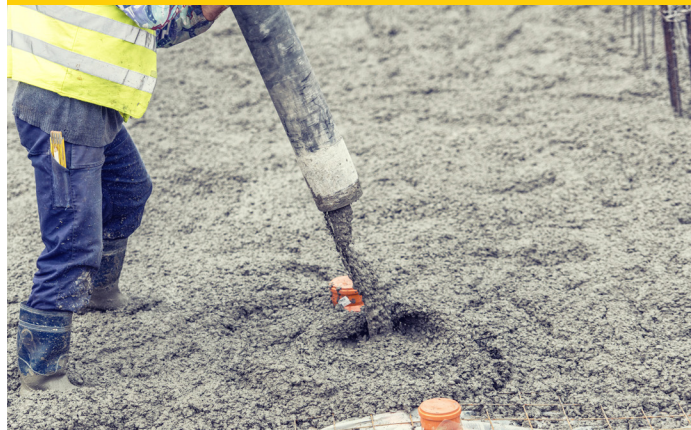
Pour the concrete, and initiate monitoring from anywhere.