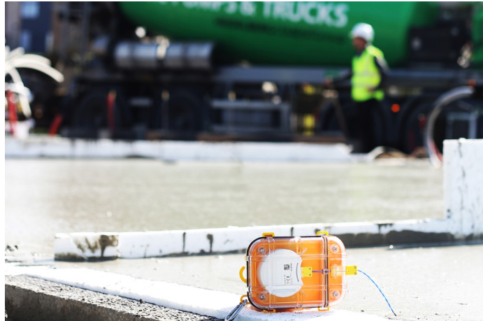
Maturix Sensors are reusable, which makes for low-cost usage.